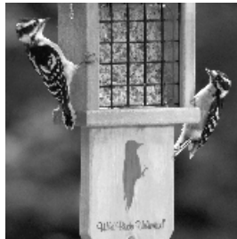
Downy Woodpeckers at a Wild Birds Unlimited Tail Prop Feeder.

Y ou can decide whether to offer birds suet or suet dough by considering the time of year and temperature. You can provide Wild Birds Unlimited suet to your birds all year long. It melts only when temperatures reach 100 degrees F (38 degrees C). When the temperatures soar try suet dough, which melts at 150 degrees F (66 degrees C).